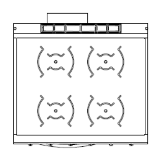
Unit on castors is the same hob height