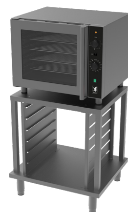
On fixed stand