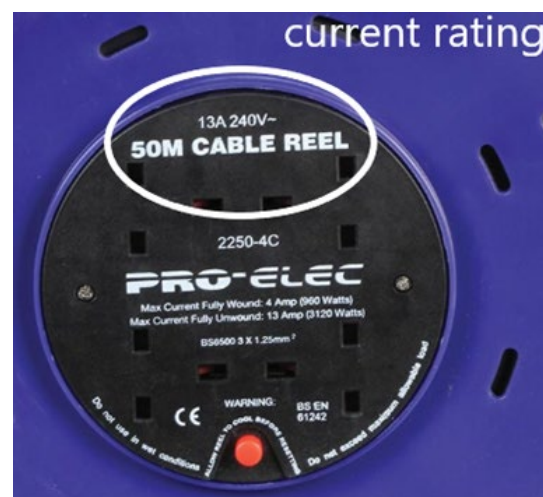
Fig 6. Extension reel