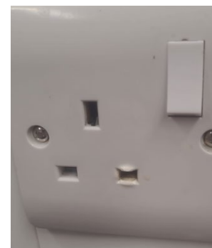
Fig 5. Damaged socket