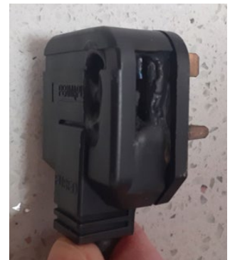
Fig 2. Melted plug