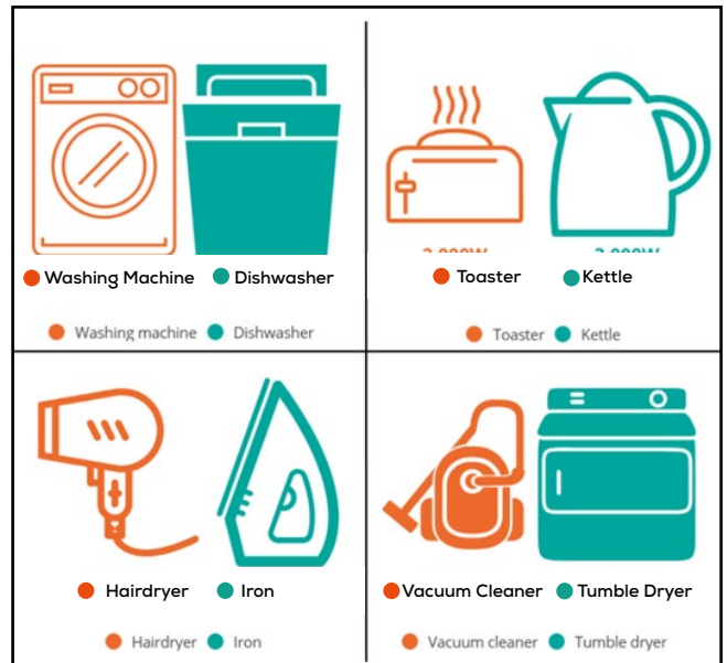
Fig 7. Example appliances that shouldn't be paired up using an extension lead.