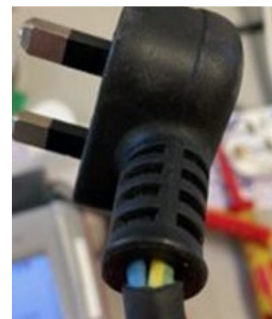
Fig 4. Exposed plug wires

If there are any signs of damage to the plug, mains cable or socket the appliance MUST NOT be used and it should be reported immediately to the maintenance team/responsible person.