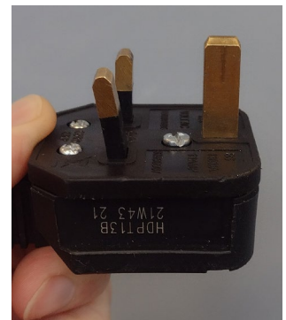
Fig 3. Bent pins